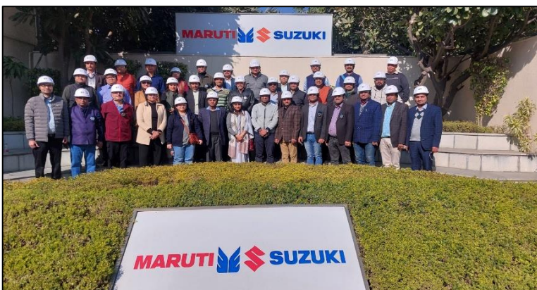
Participants of MBA (Financial Management) 2024-26 Batch – Industrial Visit at Maruti Suzuki, Manesar