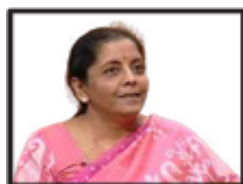
Smt. Nirmala Sitharaman Union Minister of Finance & President - AJ-NIFM Society