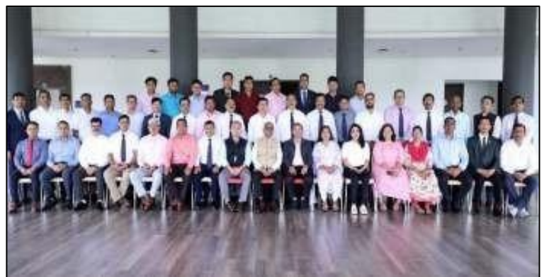
Participants of MBA (Financial Management 2022-24 Batch – Domestic Visit at NISM, Mumbai