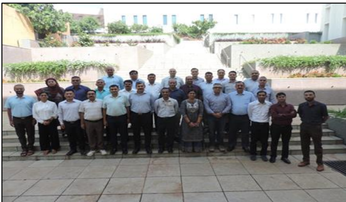
Participants of PGDM (FM) 2021-23 Batch – Domestic Visit at Goa Institute of Management, Goa