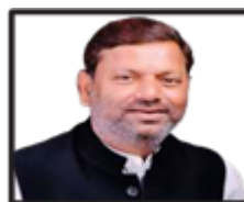
Shri Panakj Chaudhary Union Minister of State for Finance, Vice President - AJ-NIFM Society