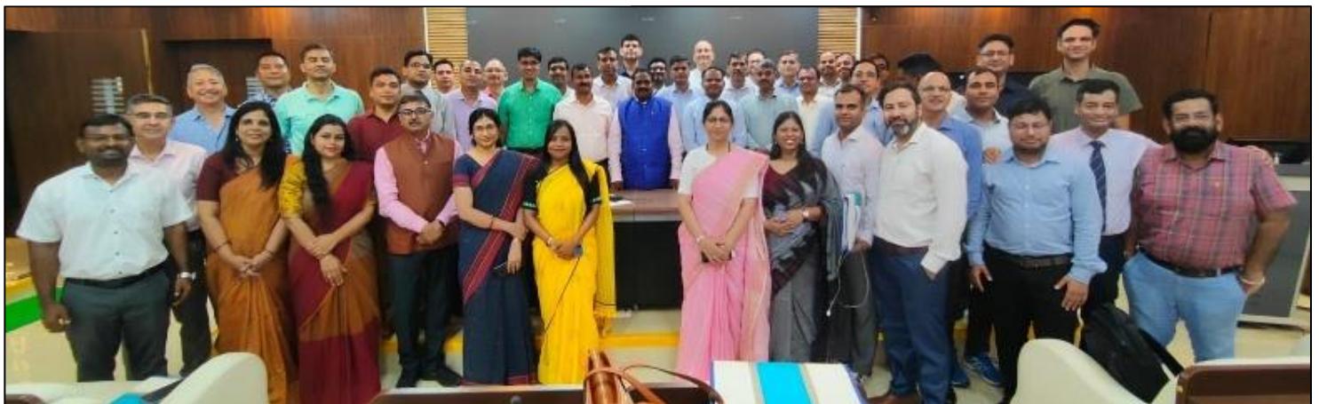
Participants of MBA (Financial Management) 2023-25 Batch – Domestic Visit at MDRAFM, Odisha